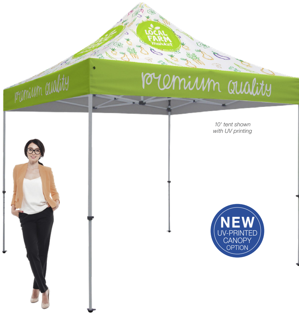
10' tent shown with UV printing