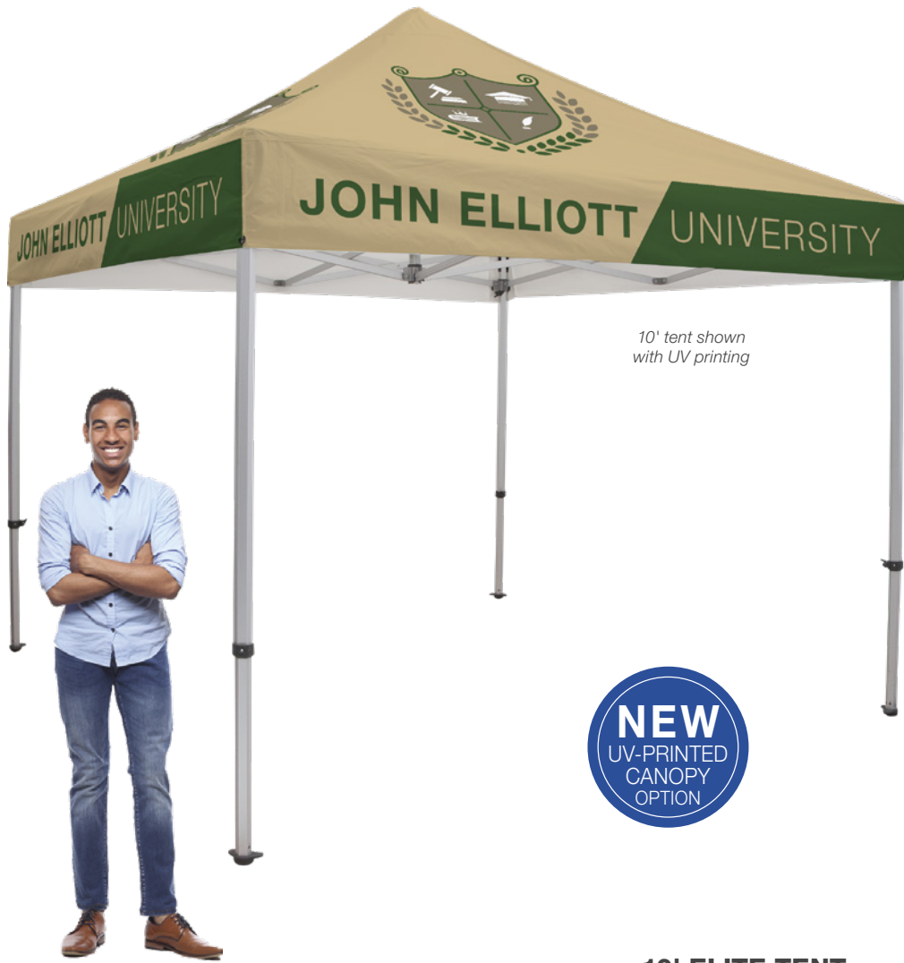
10' tent shown with UV printing