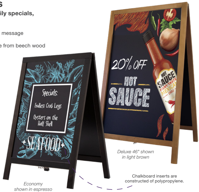
Deluxe 46" shown in light brown

Chalkboard inserts are constructed of polypropylene.