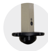
Easy-Glide Tent Feet allow the tent frame to slide on dirt and grass, preventing the legs from catching. US Patent #D760857

SHIPPING CASE: DOUBLE-WALL SHIPPING BOX.