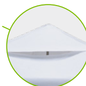
Vented canopy peak allows air to flow through to prevent wind damage.