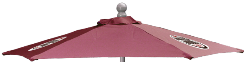
Shown in ruby with 3 locations