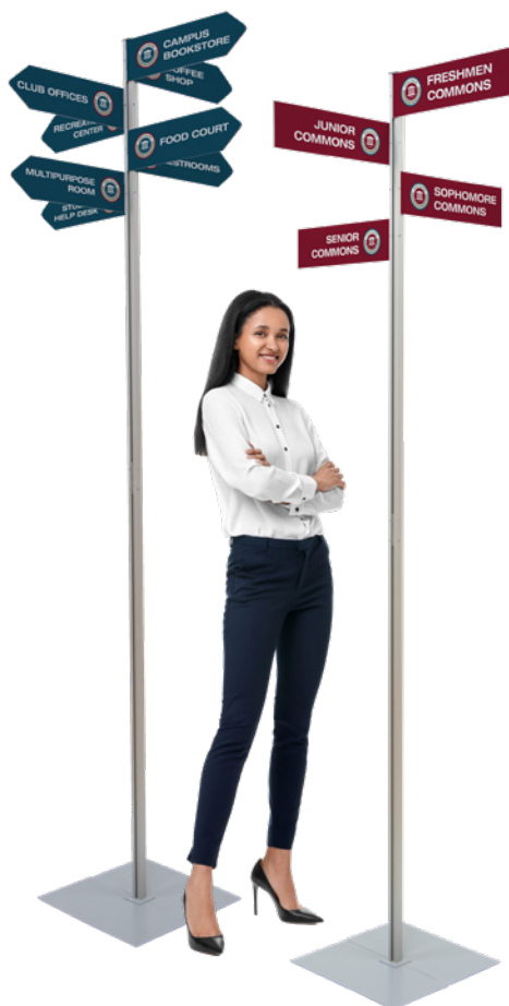
Arrow (Set of 8)