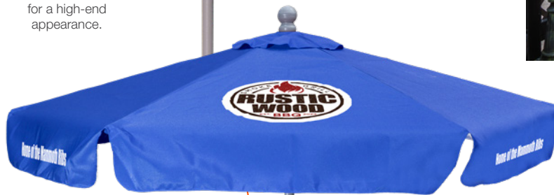
Shown in lapis with 6 locations

Pole is constructed of anodized aluminum for a high-end appearance.