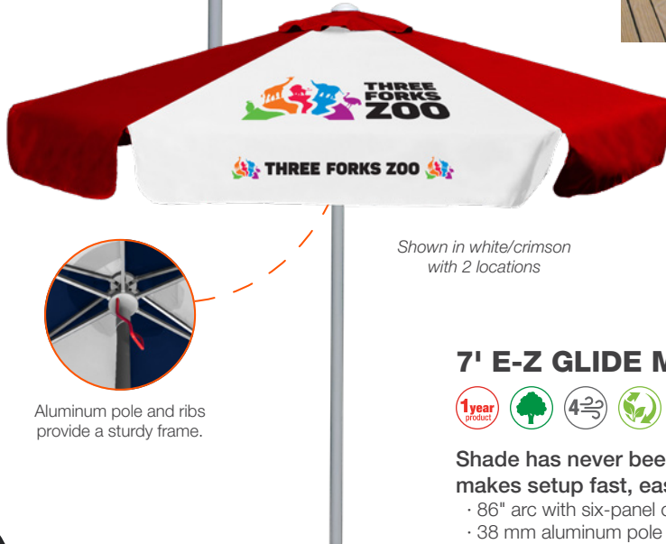
Shown in white/crimson with 2 locations