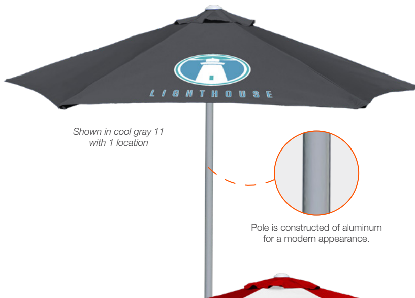
Shown in cool gray 11 with 1 location