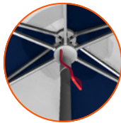
Aluminum pole and ribs provide a sturdy frame.