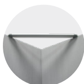
Included top corner support bars keep your enclosure stable.