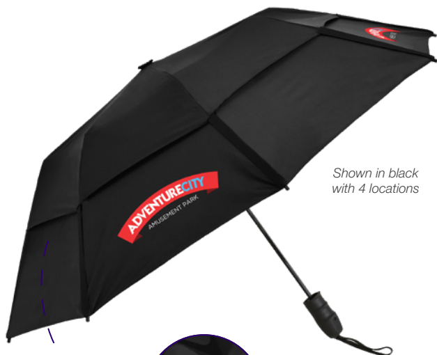
Shown in black with 4 locations

Unique wind vent technology features elastic stretchers and internal cutouts allow greater airflow for tough weather conditions.