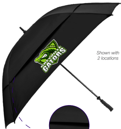
Shown with 2 locations

Auto-open button is easily accessible on an anti-slip, rubber coated, plastic handle.