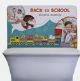
Short Back Wall