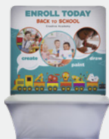
Tall Back Wall

Shown on an UltraFit throw (sold separately). Table not included.