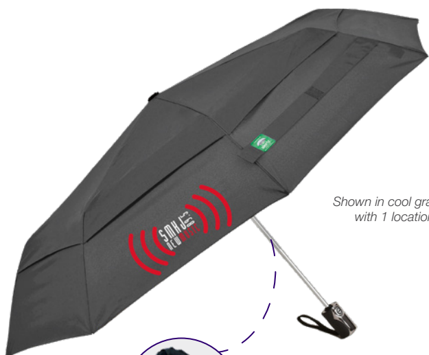
Shown in cool gray 11 with 1 location

Auto-open button is easily accessible above the wood handle.