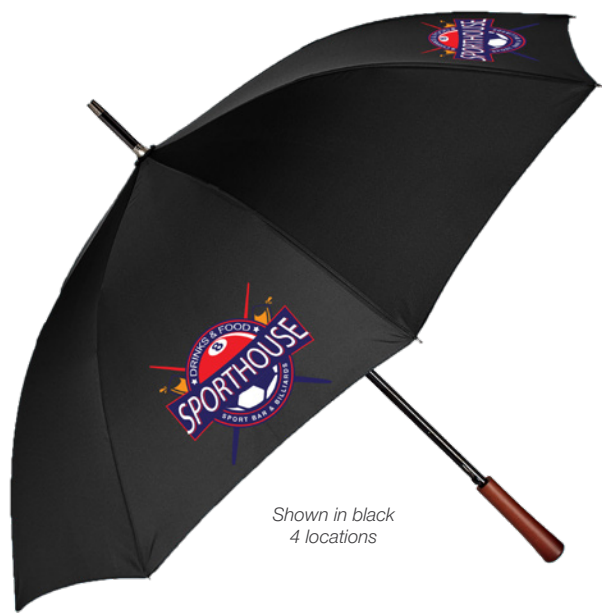
Shown in black 4 locations