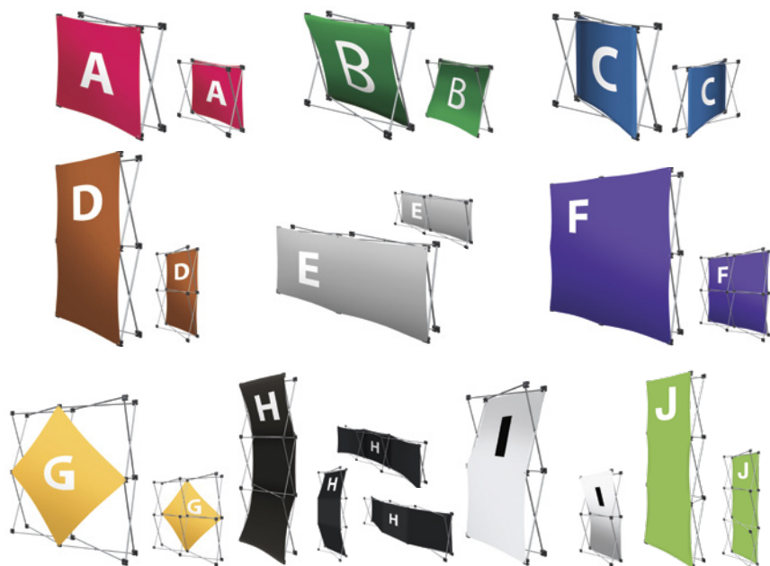
Graphic panels shown on partial frames for illustrative purposes only. Partial frames not available for purchase.