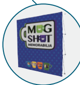
Artwork is visible on both sides so your display stands out from every angle.

CORNER FACEPLATE-ONLY LEAD TIME: SHIPS SAME DAY WHEN ORDERED BEFORE 2 PM CENTRAL