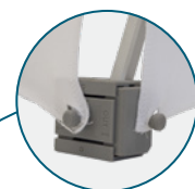
Corner faceplates (sold separately) required for installation.