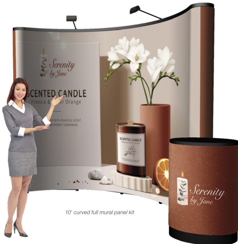
10' curved full mural panel kit