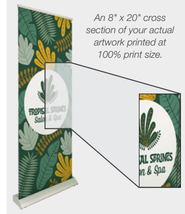
Test Strip Example

*The first test grid, match print or test strip is available at no charge (customer to pay freight). Each additional test grid, match print or test strip is $20.00(G) plus freight, expedited charges apply.