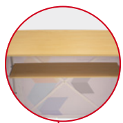
MDF countertop and internal shelf with woodgrain laminate.