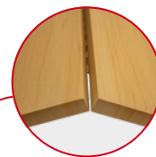
Countertop folds in half for convenient storage.