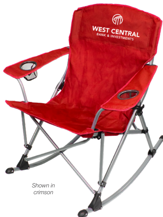
Shown in crimson