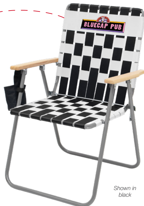
Shown in black

Graphic wrap is installed into the chair frame.