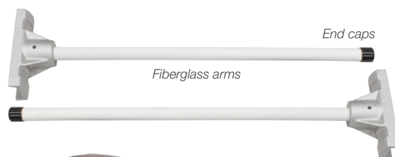
Cast aluminum brackets