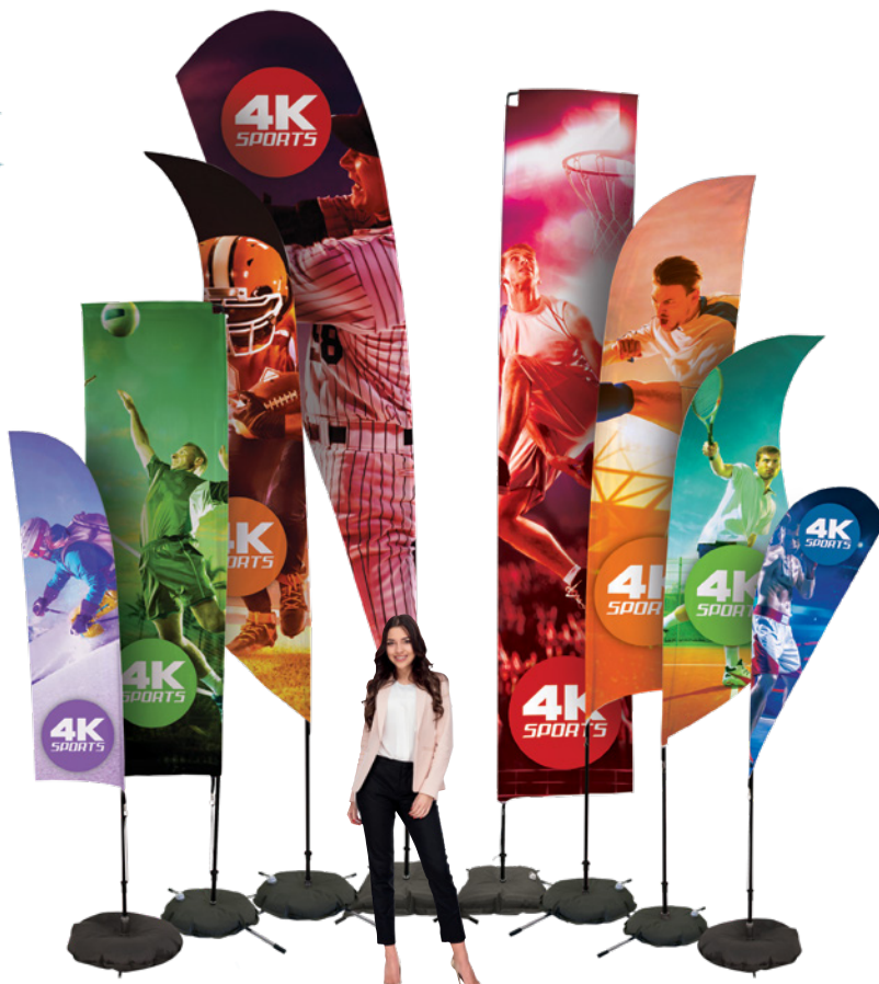
Streamline Sail Sign

Find these products and more on our website