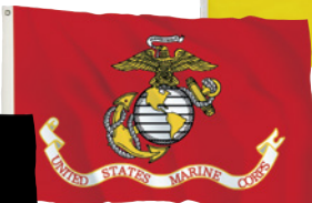
U.S. Marine Corps