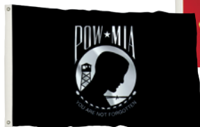
POW / MIA