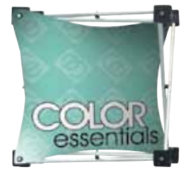
nt Banner A