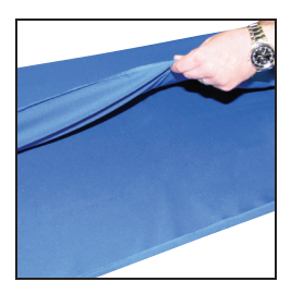
Step 2 Fold throw in thirds lengthwise with graphics to the inside, starting at the back seam.

Step 1 Remove the throw from the table. Lay out throw flat on the floor with graphics facing up.