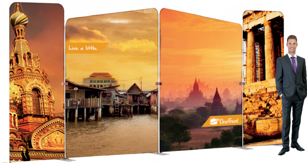
Add some character to any backdrop by mixing and matching various shapes and sizes.