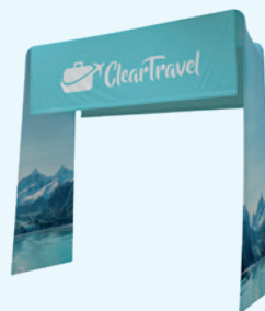
Triumph with Runner