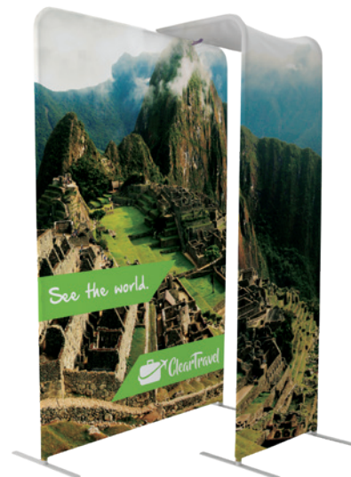
Extend an otherwise flat display into the third dimension.