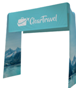
Triumph with Runner