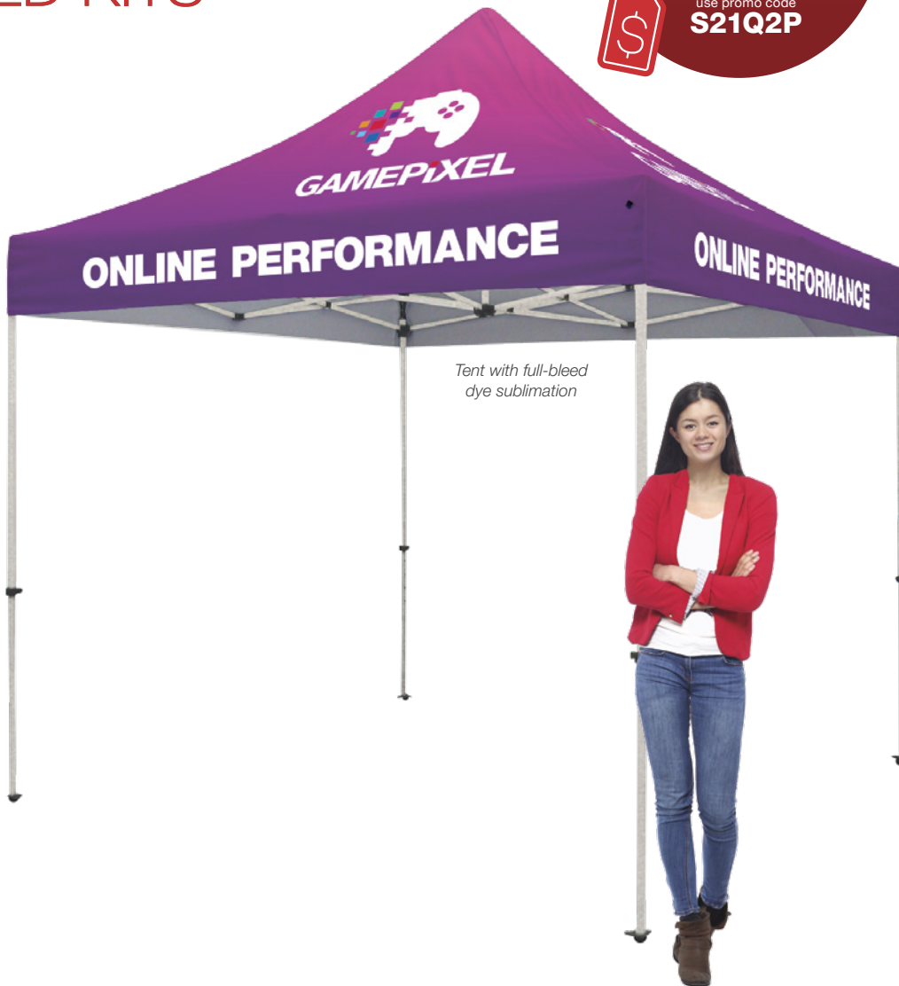
Tent with full-bleed dye sublimation