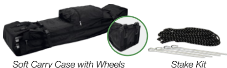
Soft Carry Case with Wheels