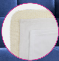
Sherpa, Velveteen and Fleece feature different fabric textures.