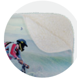
Sherpa blanket is finished with a whipstitched edge.