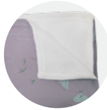
Velveteen blanket is finished with a hemmed edge.