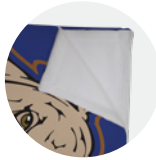
Fleece blanket is finished with a hemmed edge.

Promo pricing is only available for item numbers listed on this flyer. Inventory limited to stock on hand.