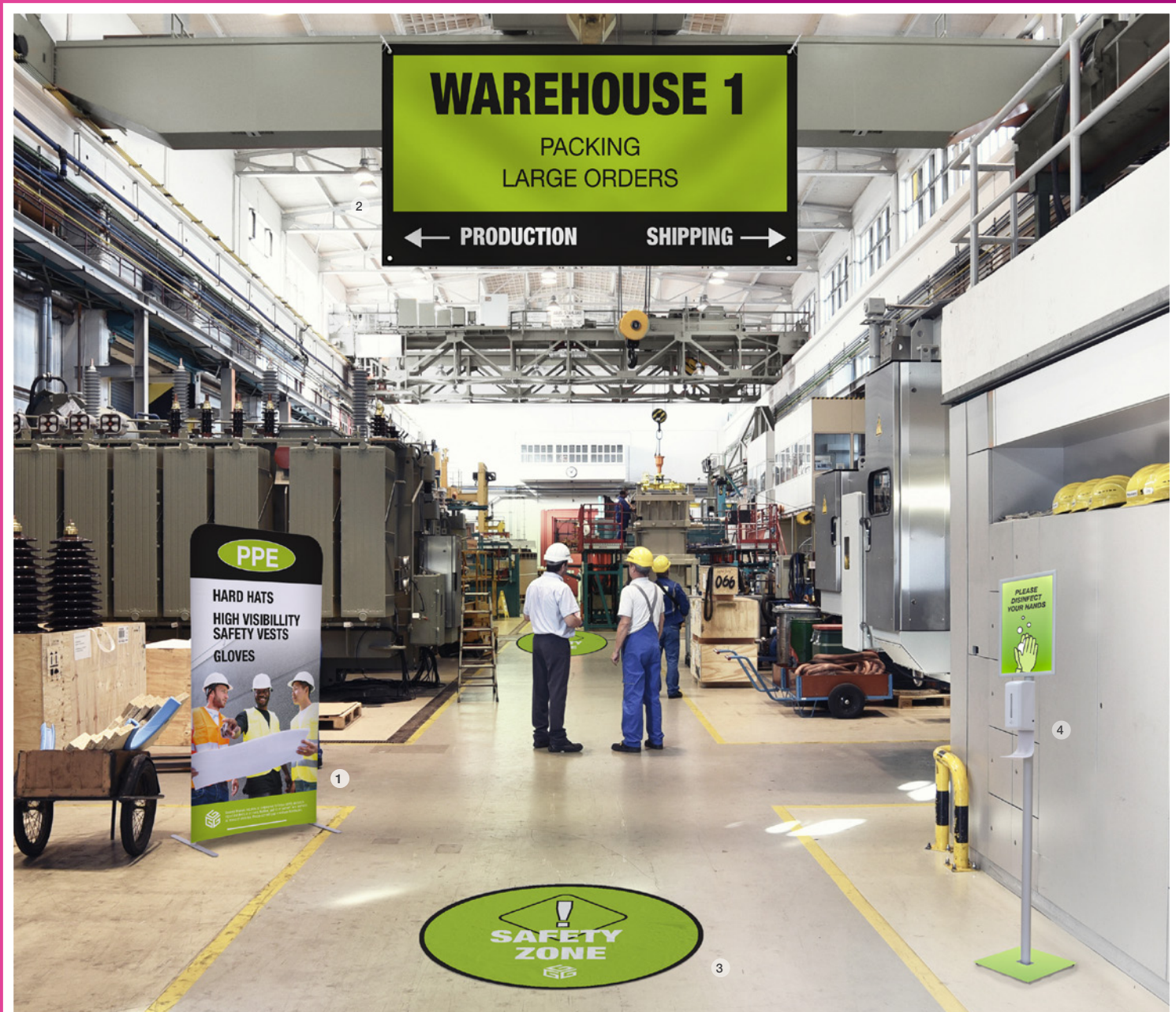
1. EuroFit Straight Wall 2. Vinyl Banner 3. Indoor Surface Grip Circle 4. Deluxe Touch-Free Hand Sanitizer

MAXIMIZE YOUR IMPACT with promotional displays