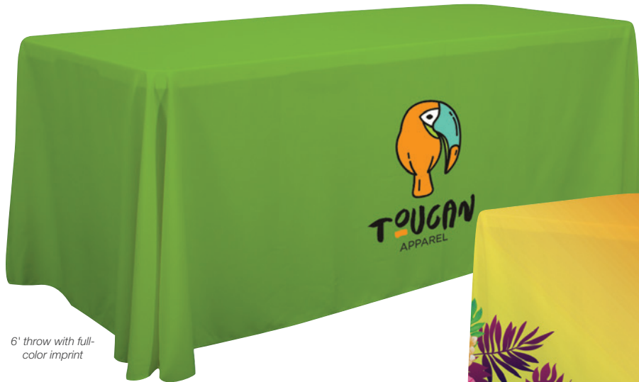
6' throw with full-color imprint

Also Known As: Table Throws • Table Cloths • Table Skirts • Table Coverings