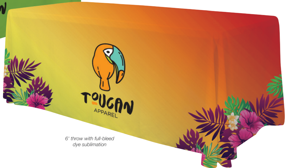
6' throw with full-bleed dye sublimation