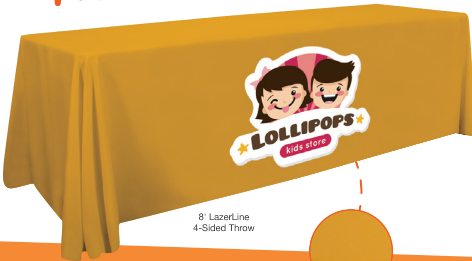
8' LazerLine 4-Sided Throw