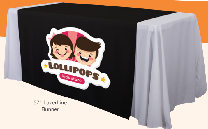
57" LazerLine Runner